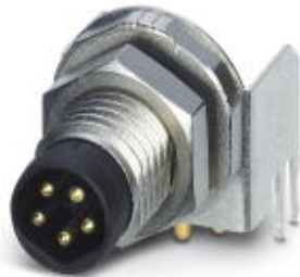
Sensor/actuator flush-type plug-in connector, plug, 5-pos., DeviceNet, M8, rear/screw mounting with M10 fastening thread, with angled solder connection

Please be informed that the data shown in this PDF Document is generated from our Online Catalog. Please find the complete data in the user's documentation. Our General Terms of Use for Downloads are valid ( http://download.phoenixcontact.com )